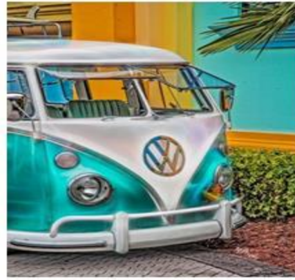
"Bulli Split" by LK Phipps